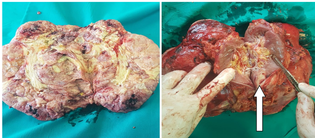
Fig. 2 Left: medial side of the tumor. Right: lateral side with kidney and tumor in lower pole arrow)