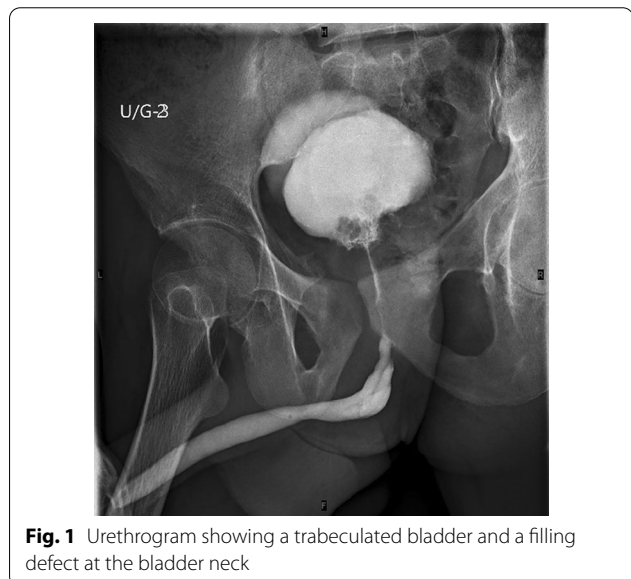
Fig. 1 Urethrogram showing a trabeculated bladder and a filling defect at the bladder neck

Owing to the fact that the patient had obstructive lower urinary tract symptoms, a urethrogram was done, which showed a filling defect in the region of the bladder neck (Fig. 1). A provisional diagnosis of bladder mass was made, and the patient underwent cystoscopy, which showed multiple polypoidal growths at the neck of the bladder, a single central fibrotic band on the bladder dividing the bladder in 2 halves and normal ureteric orifices. The polyps were resected transurethrally, and the specimen was sent for histopathology. Later, he was followed in consultant clinic, and histopathology revealed a bladder mucosa exhibiting downward growing papillary architecture lined with transitional epithelium, representing a hamartoma of the urinary bladder (Fig. 2). No comment was made on tumor-free surgical margins. Postoperatively, patient was given injection mitomycin 40 mg intravesically, for one hour, since it was assumed at