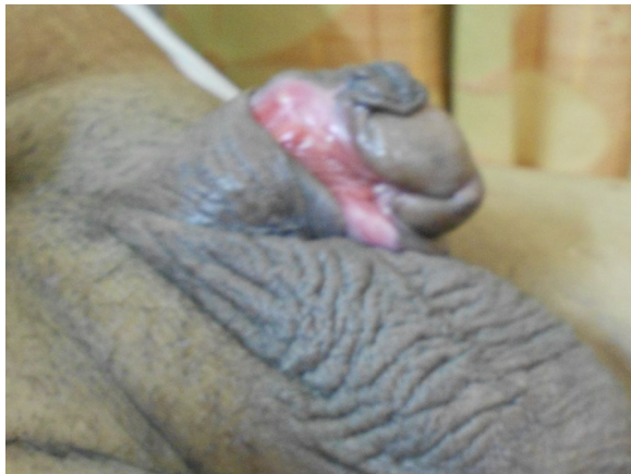
Fig. 2 Showing the erosion of urethra with 90° anticlockwise torsion

of urine [16]. Recurrence of stricture is not a problem in the spinal cord patients because these patients are put on clean intermittent catheterization. Four of patients put on CIC did not have any recurrence, but one patient with spontaneous voiding has meatal stenosis. Limitation of the study is of 12 patients only, so statistically significant conclusions cannot be derived. Since our study duration is short, longer follow-ups are required to ascertain long-term complications of the reconstructive surgery such as stricture, diverticulum, urethrocutaneous fistula.