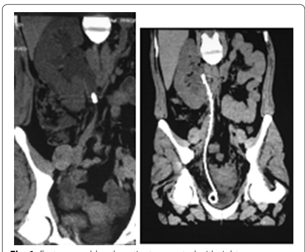
Fig. 1 Forty-year-old male patient presented with right upper ureteral stone (1.7 cm). Stone disintegration was performed using semirigid URS and laser lithotripsy. JJ stent was placed at the end of the procedure

In Group A, all patients received general anesthesia. Cystoscopy and retrograde pyelogram were performed first, and then 6/7.5 semirigid ureteroscope was introduced through the ureteric orifice. Using follow-the-wire technique, a sensor guide wire was introduced till the level of the stone [10]. Under direct vision, the sensor guide wire was advanced to pass the stone all the way up to the kidney. Semirigid ureteroscope allowed steadiness during stone manipulation and subsequently allowed controlled movement to pass the wire beyond the stone without pushing the stone back to the kidney. Through the whole procedure, the fluid irrigation force was limited to a degree sufficient to see the stone without any pushing force (Fig. 1).