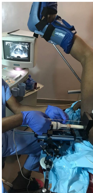
Fig. 3 Consultant Radiation Oncologist performing the radioactive iodine 125 seeds implants procedure

The facility has offered scholarship in form of clinical rotation for junior and senior residents from other institutions who may be interested in learning the skill. The clinic through AROI has also trained a physicist and technician from other institutions. The goal is to build human capacity and to ensure that radioactive seed implants are replicated in all the other five geopolitical regions of Nigeria. The clinic is in the last stage of securing National Health Insurance Scheme, so that the treatment can be available for low income earners and grassroot population.