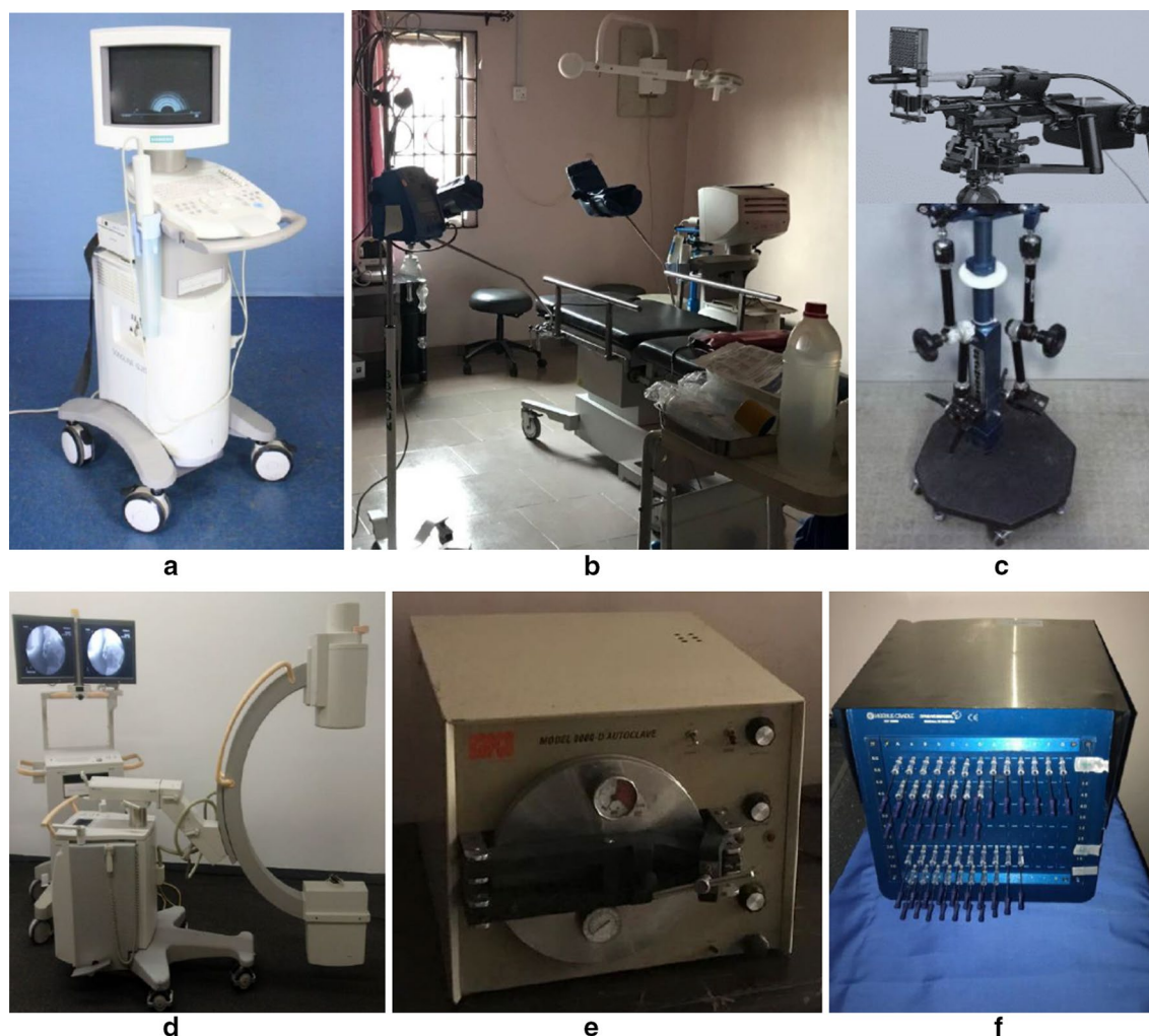
Fig. 2 Main technology components used to perform the first brachytherapy prostate implant procedures at the LA'Newton oncology Clinic, Benin City—Nigeria. A major technology component not included in the figure is the software, treatment planning system (TPS), used to calculate the dose distribution generated by the radioactive I-125 seeds

score of 4. The MRI of the prostate (unfortunately done after biopsy) showed a prostate measured 42 mm AP by 50 mm transverse by 42 mm craniocaudal in size for a calculated volume of 44 cm 3 . The post-biopsy hemorrhage limits evaluation for focal prostate carcinoma. No definitive focal suspicious signal abnormality identified in the prostate gland. Adenopathy is negative. PI-RADS category: known cancer.