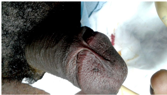
Fig. 1 Superior view of the dorsal frenulum