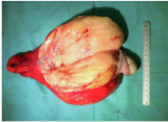
Fig. 3: Transected specimen showing a gelatinous surface, with the testis and epididymis separate from the mass.