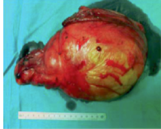
Fig. 2: Photograph of the paratesticular mass (weight 1,47 kg).

In the paratesticular region, neoplastic disease may arise from the spermatic cord (commonest), epididymis, mesenchymal layers surrounding the testis or the true appendages 1 .