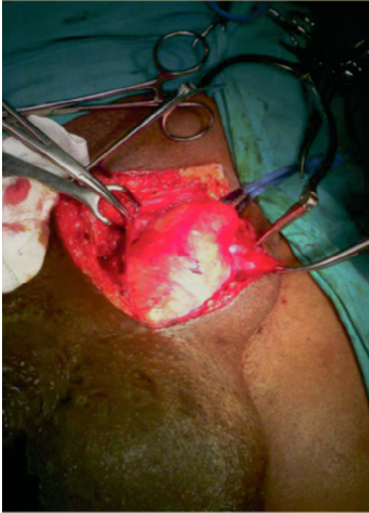
Fig. 1: Intra-operative photograph of the mass in the left inguinal canal.

liposarcoma, adipocytic type (Figure 4a). In occasional sections scattered large atypical hyperchromatic stromal cells, some of which were multinucleated, were seen (Figure 4b). No dedifferentiated component was identified. The testis showed focal, mild atrophy. The epididymis showed no significant abnormalities. The tumour resection margins were clear.